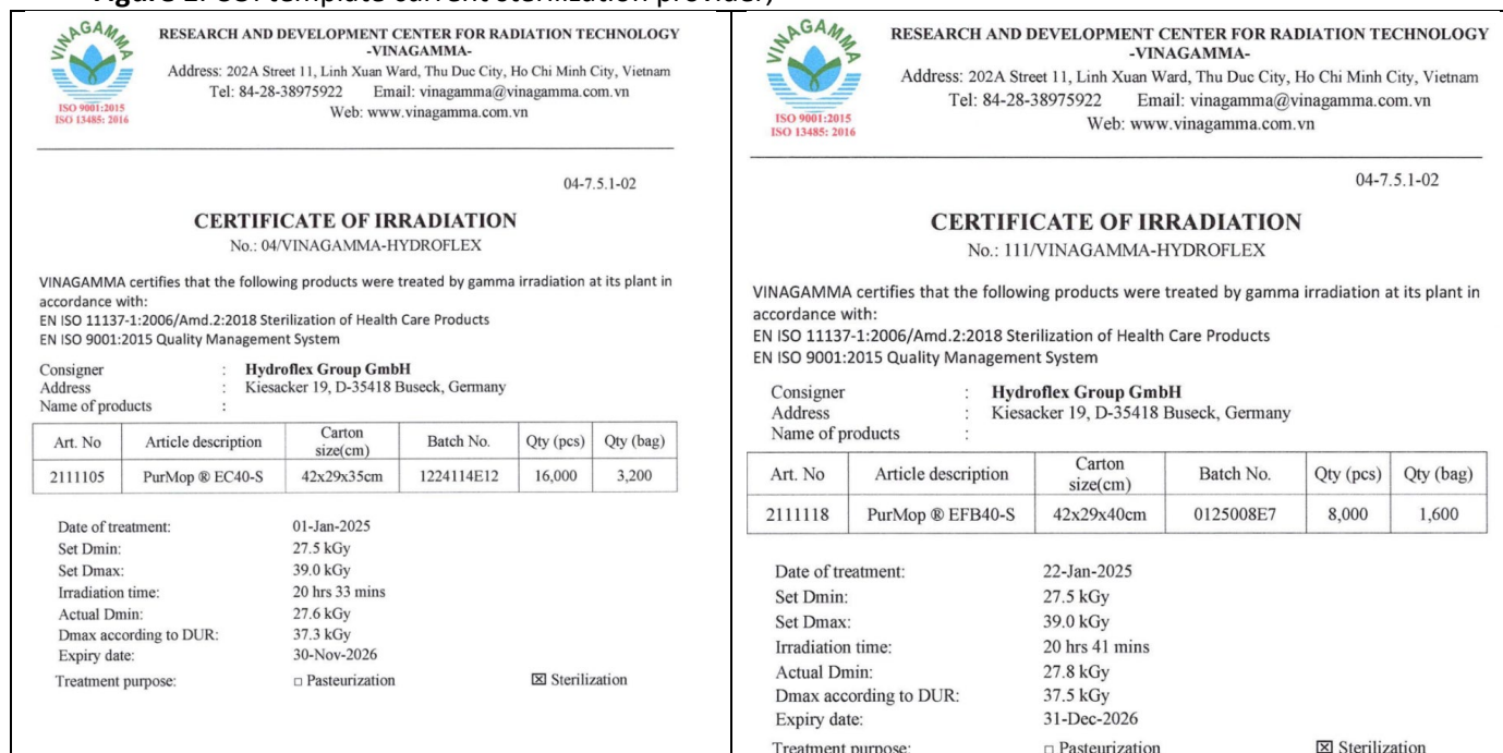
Figure 1. COI template current sterilization provider,